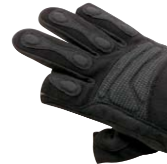
>> SAFEGUARD INOX of – thumbs and the index finger are free

The special protective gloves for the auxiliary and rescue services.