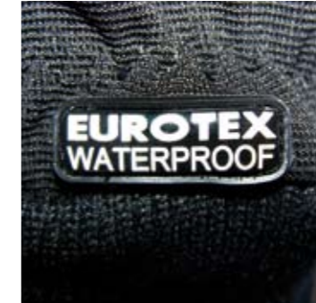
>> SAFEGUARD INOX WP – waterproof, i.e. with a moisture barrier