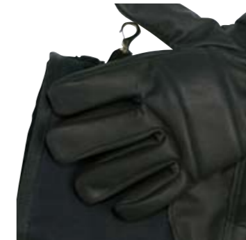
>> extra long safety gauntlet and a sewn-in knuckle protector made from Suprotec (special foam)