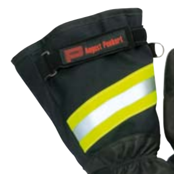
>> with 3M reflective stripes

The safety glove for auxiliary and rescue services.