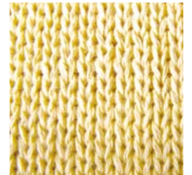
>> cut protection + heat insulation made from 100% KEVLAR®

The tried and tested leather gloves from Penkert offer ideal conditions for all applications associated with the auxiliary and rescue services. The physical safety of the emergency staff always takes centre stage. Reliable hand protection is one of the key requirements. With the BRAVEMAN glove you are on the safe side in all situations and help not only yourself, but others too.